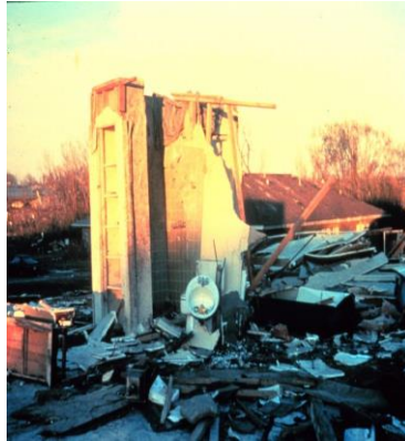
Ground floor bathroom