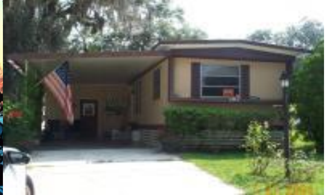
Not the safest place to be in a tornado!

In An Open Outdoors Area: Lie flat in the nearest ditch or ravine, and point your feet toward the tornado to keep your head protected from flying debris. Be alert for flash flooding caused by thunderstorm rains. Do not seek shelter under an overpass or in your car.