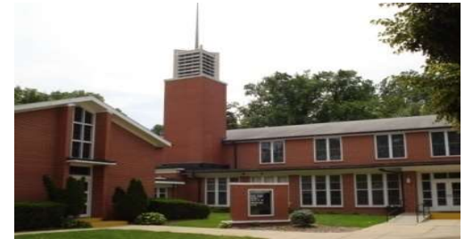
SAC Memorial Chapel & Annex ..... Bldg 463 (At the corner of the parade grounds)

Duty Hours: Monday – Friday 0730 -1630 Commercial Phone .....294-6244