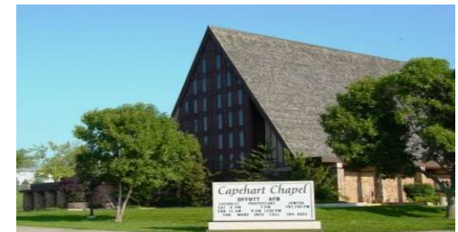
Capehart Chapel & Annex ..... Bldg 1226 (On the corner of Capehart Road and 25th Street across from Ehrling Bergquist Clinic)

Duty Hours: Monday – Friday 0730 -1630 Commercial Phone .....294-6244