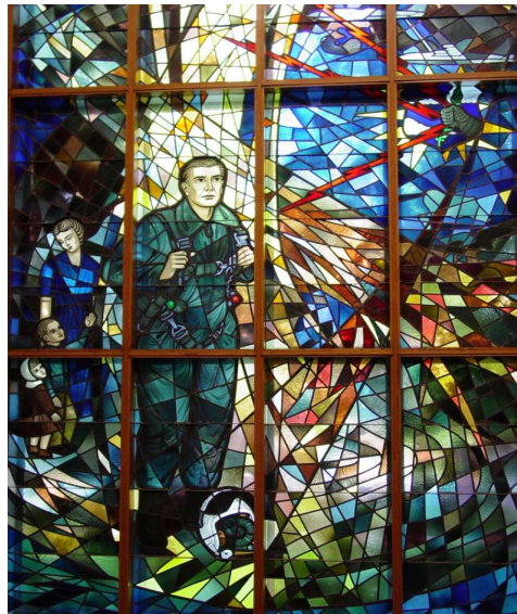
MEMORIAL STAINED GLASS SAC MEMORIAL CHAPEL