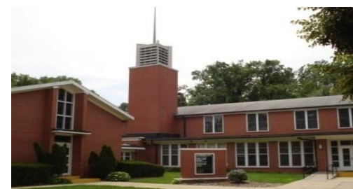
SAC Memorial Chapel & Annex.....Bldg 463 (At the southwest corner of the parade grounds)