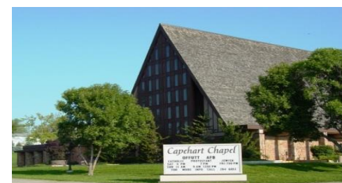
Capehart Chapel & Annex.....Bldg 1226 (On the northwest corner of Capehart Road and 25th Street, across from Ehrling Bergquist Clinic)