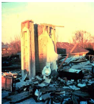
Ground floor bathroom