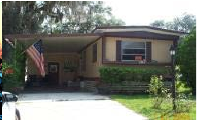
Not the safest place to be in a tornado!

In An Open Outdoors Area: Lie flat in the nearest ditch or ravine, and point your feet toward the tornado to keep your head protected from flying debris. Be alert for flash flooding caused by thunderstorm rains. Do not seek shelter under an overpass or in your car.